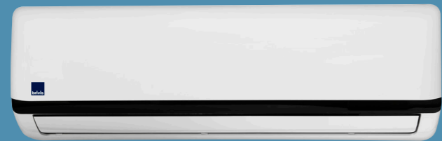
4.2kW & 5.0kW