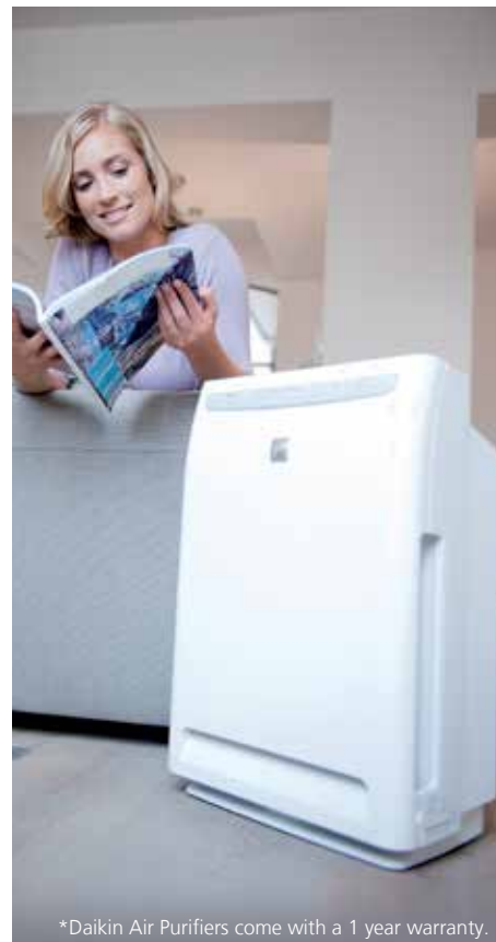
*Daikin Air Purifiers come with a 1 year warranty.