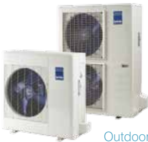
Outdoor Condensing Unit Specifications