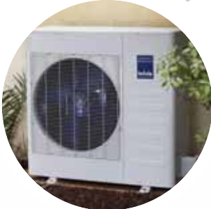
Outdoor Condensing Unit