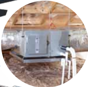
Indoor Fan Coil Unit installed within a roof space