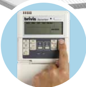
Manual or programmable controllers available